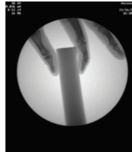
TECAPEEK™ Classix™ XRO™ Radio Opaque materials are clearly visible on X-rays.

These materials are offered for extended time contact with the patient and are tested by resin lot with an additional cytotoxicity test by extrusion lot. A typical extended contact application would be temporary dental implants. Since plastics are typically transparent to X-rays, the XRO formulation allows oral surgeons to see the orientation of the temporary abutment by reflecting the X-rays, thus making the part visible.