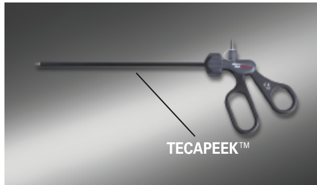
Application showing the use of TECAPEEK™ in an endoscopic surgical device.

TECAPEEK™ grades are characterized by high strength, extreme resistance to hydrolysis and resistance to ionizing radiation. All conventional sterilization methods are compatible. The above medical grades are supported with biocompatibility testing to the ISO10993 matrix to support their use in contact with blood and tissue for 24 hours or less. Additionally, Ensinger is an authorized converter for Invibio's PEEK™ Classix™ resin. PEEK™ Classix™ is tested by resin lot to support contact with the patient for up to 30 days.